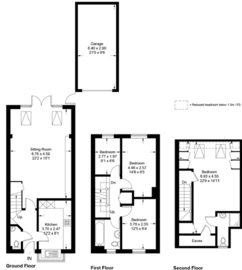
Illustration for identification purposes only, measurements are approximate, not to scale. Imageplansurveys @ 2023

Total = 139.9 sq m / 1506 sq ft (Excluding Eaves)