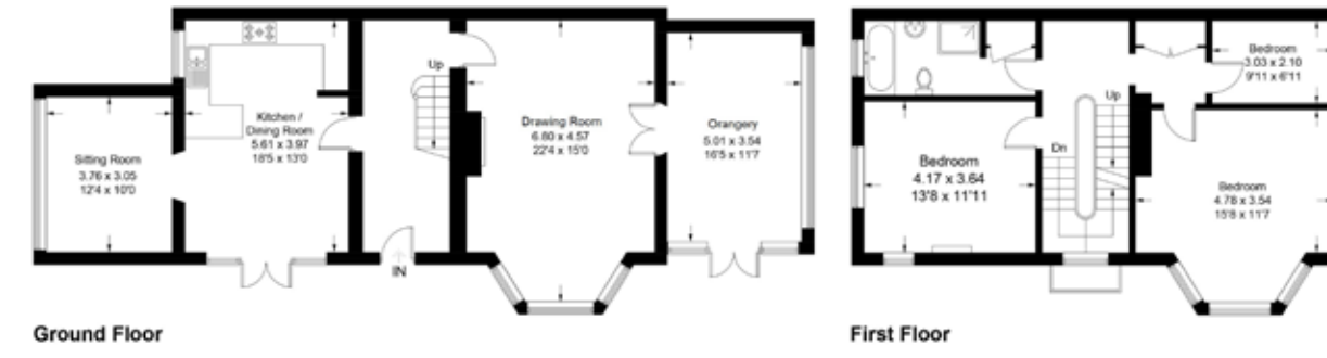
Illustration for identification purposes only, measurements are approximate, not to scale. Imageplansurveys @ 2023

Consumer protection from unfair trading regulations 2008